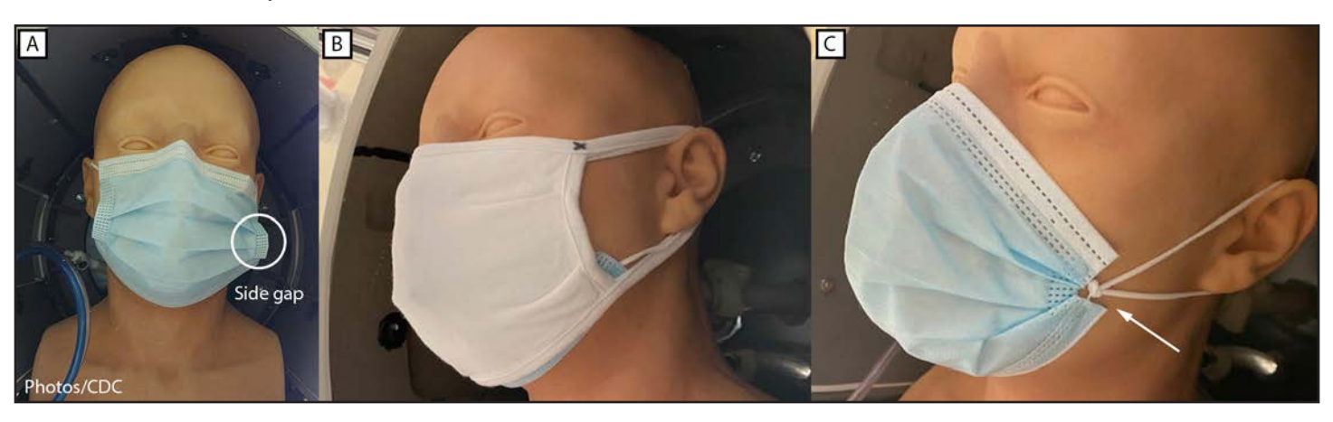
FIGURE 1. Masks tested, including A , unknotted medical procedure mask; B , double mask (cloth mask covering medical procedure mask); and C , knotted/tucked medical procedure mask